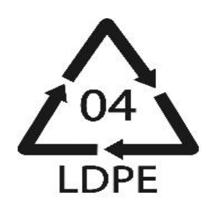
Figure 3 LDPE identification symbol

Objects made of LDPE are identified in the American SPI (Society of the Plastics Industry) identification system with the symbol on the bottom or back (Figure 3) (Vaid et al., 2020).