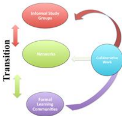
Graphic 2 Types of collaborative work and their evolution according to their formalization

Not because of their forty year presence they have lost importance, on the contrary, networking's importance has been renewed into becoming a strategic piece that help academic communities transition from study groups to networks and in time evolve into formal learning communities, process which is shown in the graphic above.