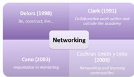
Graphic 1 Theoretical Framework

The advancement towards the suggested academic reflection mentioned above could be sparked with the use of techniques such as lectures, academic debates and case analysis studies (Delors, 1998). All together these theoretical proposals crystalize under the following graphic.