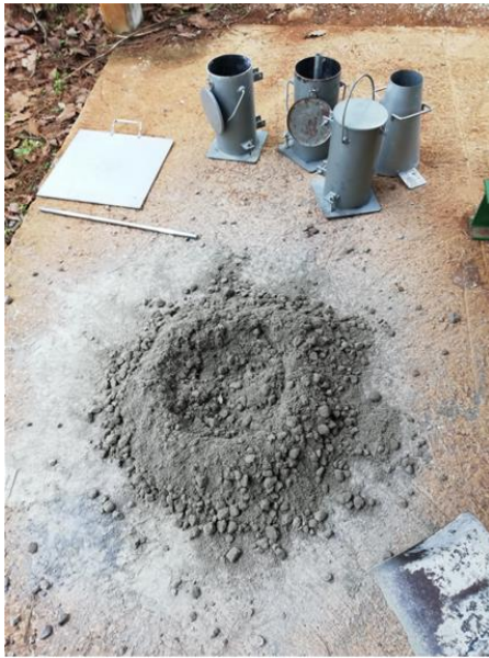
Figure 4 Mixing of concrete aggregates

A hard, clean surface was used to mix, moistening it with water. Figure 4 shows the mixing of the materials.