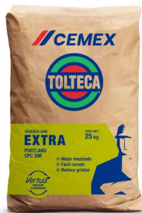
Figure 1 Bulk of extra gray Portland type cement, CPC-30R, CEMEX-Tolteca Brand

Figure 1 shows CPC 30R Extra Cement is specially formulated to reduce the appearance of plastic shrinkage cracks in concrete exposed to extreme environmental conditions, improve the consistency of the mixture, produce a mixture that is easier to handle and avoid the process curing, a unique product on the market. CPC 30R Cement meets the specifications of the Mexican standard NMX-C-414-ONNCCE.