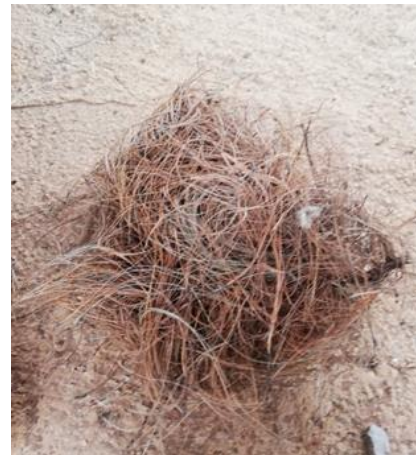
Figure 2 Drying of natural ocoxal fiber

The natural pine needle fiber (ocoxal) was collected Figure 2 shows the drying and its composition can be seen.