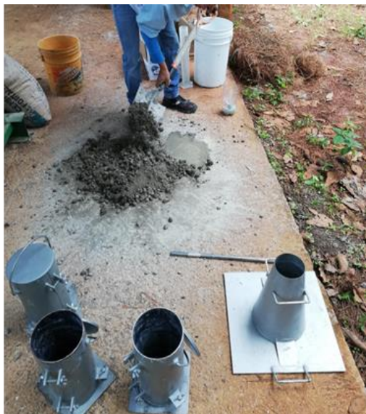
Figure 5 Preparation of the concrete mix

Figure 5 shows when the mixture of cement with sand, gravel and water free of impurities was made to make the hydraulic concrete cylinders.