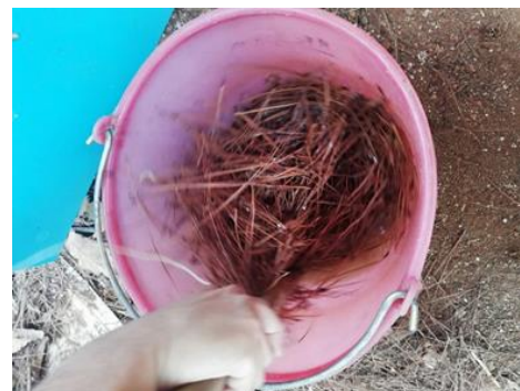
Figure 3 Washing of the natural fiber of (ocoxal)

In Figure 3, the natural fiber was immersed to give it a waterproofing treatment with cactus mucilage in a container.