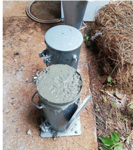
Figure 6 Preparation of concrete cylinders

Figure 6 shows the metal cylinders filled with fresh concrete added with natural ocoxal fibers. The mixture was vibrated to dislodge the air trapped in the concrete in the metal molds and after 24 hours. They were cured by immersing them in water.