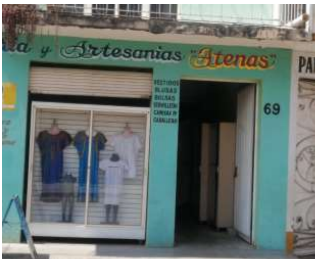
Figura 8 Craft enterprise "Atenas".