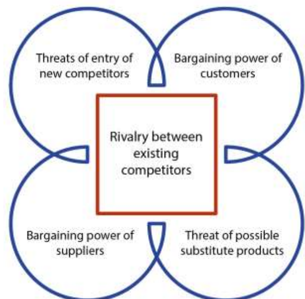
Figure 1 Porter's Five Forces Model

To visualise Porter's model graphically, see the following figure: