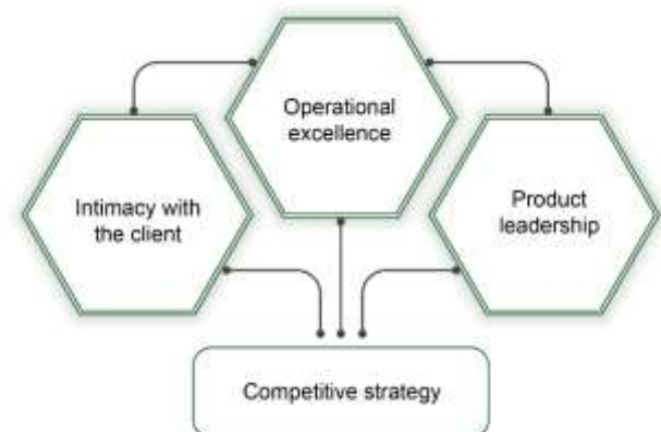
Figure 3 Model based on the Treacy and Wiersema theory of value disciplines

Treacy and Wiersema's (1993) model is based on three dimensions: customer intimacy, operational excellence and product leadership. See Figure 3.