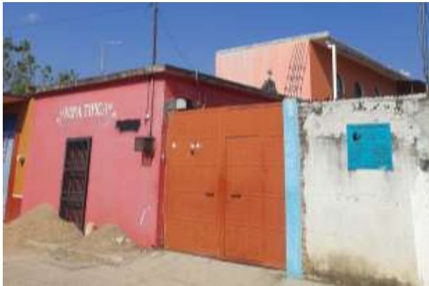
Figure 7 Artisanal enterprise

The following figures show certain physical differences between the artisan enterprises in San Antonino Castillo Velasco, Oaxaca.