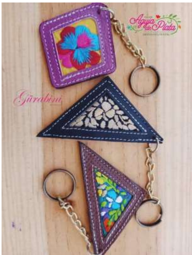
Figure 10 Key rings with embroidery from San Antonino Castillo Velasco, Oaxaca, Mexico

Undoubtedly, knowledge and its application has led some handicraft businesses to increase their competitiveness to face globalisation, they recognise that it is necessary to generate changes in their processes and products to maintain a place in the market. Innovation is an issue to be highlighted by the artisans, who mention that it is through innovation that they adapt their products to the needs of an increasingly demanding client and with different expectations, validating the blue oceans model, derived from the fact that few artisan businesses in the locality have opened new markets by promoting innovative products. See Figure 10.