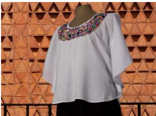
Figure 6 Blouse with embroidery by San Antonino Castillo Velasco

For many years, mainly the women of the community, have promoted for generations the art of a unique style of embroidery in the state, producing mainly blouses that are currently internationally recognised, this being their typical product that gives them identity (HACSACV, 2022). See Figure 6.