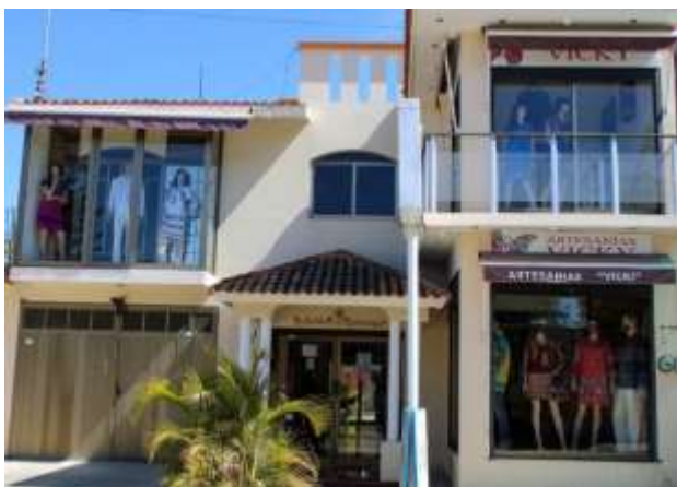
Figura 9 Vicky" Handicrafts