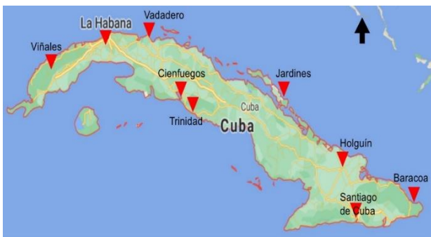
Figure 1 Main tourist enclaves of the Republic of Cuba

The Caribbean island of Cuba, has outstanding natural attractions to develop tourist activities, but at the same time, it has a historical-cultural legacy to make some localities join this dynamic. Of the above, known are tourist destinations such as: Havana, Old or colonial Havana, Vadadero beach, Holguín, Santiago de Cuba, Jardines del Rey, Trinidad, Cienfuegos, Baracoa, Viñales Valley, among others.