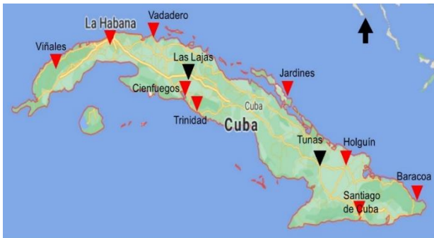
Figure 2 Regional strategic location of the tourism integration proposal for the province of Las Tunas and the city of Las Lajas, triangles in black

Another place that is considered with potential, within the province of Cienfuegos, and taking advantage of the tourist positioning that the city already has, is the municipality of Las Lajas, which is located a few kilometers from the tourist city of Cienfuegos and can be achieve regional integration from the tourist links that are linked between both cities, which has different potentialities within cultural tourism; This, considering that the highway that passes through the city of Cienfuegos, passes through the city of Santa Isabel de las Lajas. see Figure 2.