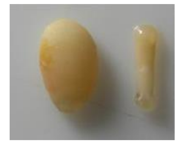
Figure 3 Dead seeds

Figure 2 Seed completely stained red in all its structures. a) Endosperm, b) Embryo, consisting of c) Cotyledonary leaves, d) Hypocotyl and e) Radicle.