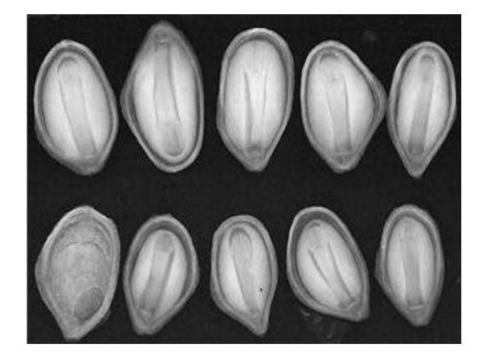
Figure 1 X-ray plate image of Pinus devoniana seed using a sample of 10 seeds at and speed of 20 seconds

A FAXITRON MX-20 seed X-ray machine was used. Using 400 seeds distributed in 4 replicates of 100. Each seed was identified to follow its physiological condition. Once the were digitised. images the external characteristics were obtained, such as length, width and thickness, and internal characteristics: embryo cavity, embryo length and width of each seed. It was necessary to carry out tests with different numbers of seeds to establish the appropriate calibration of the equipment and the optimum sample size; in subsequent tests of radiographic plates, exposure time and distance between the X-ray emitting tube and the seed were determined with an automatic calibration that varied between 1.3 and 2.7, which allowed a clearer visualisation of the internal structures of the seed, as can be seen in figure 1. It was thus established that, according to the characteristics of the equipment used, the sample size per plate or image is 10 seeds.