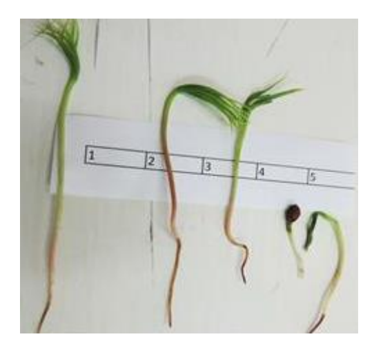
Figure 4 Seedlings of P. devoniana from the St. George germination test

The standard germination analysis was carried out by incubating the seed at 25°C for 14 days using germination paper as substrate. 14 days using germination paper as substrate, the seedlings obtained were classified as normal, abnormal, in addition to counting the dead seeds, figure 4 shows the irradiated seedlings obtained in this test.