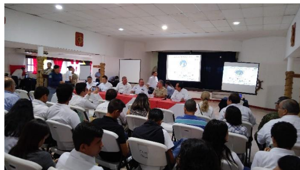
Figure 7 Meeting SPCDHOSPP activation.

In Figure 7, activation occurs SPCDHOSPP where all involved are presented and the activities to be performed are assigned. Students previously trained, are assigned in various areas of planning.