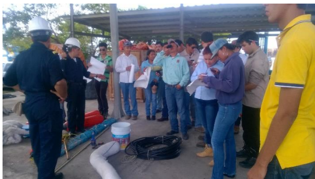
Figure 4 Different absorption equipment hydrocarbons.