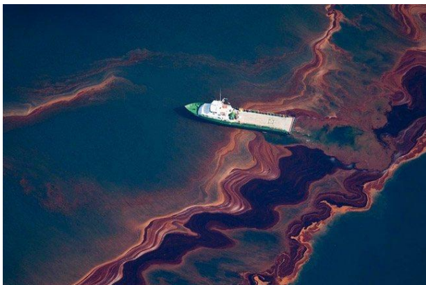
Figure 2 Oil spill.

On April 22, 2010 an oil spill was detected in the Gulf of Mexico (Figure 2). Which it reached more than 1,550 km 2 and was moving towards the east side from the Louisiana coast to the shores of Alabama and Mississippi. This event is known as "environmental disaster" before the great "black tide" that formed the oil spill.