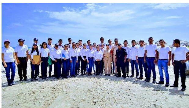
Figure 5 Students finishing their training workshop containment and recovery of hydrocarbons.