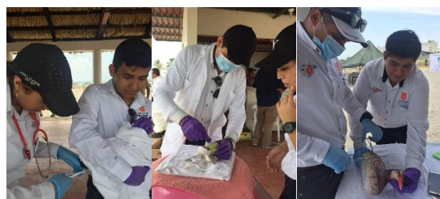
Figure 8 Students participating in the SPCDHOSPP.

In Figure 8, students are observed in the area Oiled wildlife, they were used in order intake, washing and stabilization of the animals were "rescued" during the drill. In Figure 9, has already seen the group of students who participated in the drill.