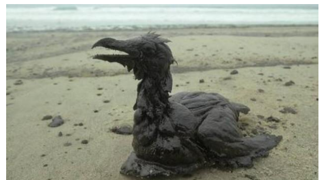
Figure 1 Oiled bird.

In Figure 1, a Oiled bird is observed. The birds are among the species most affected and vulnerable to oil pollution, since they eat when cleaning and make up their pens, can be lethal; also they die as consequences of suffocation, hunger and loss of body heat damage to the plumage, as the impregnated feathers lose their waterproof and insulating properties.