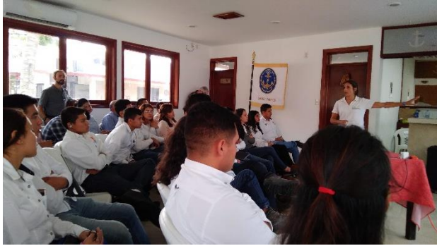
Figure 10 Students participating in the workshop Oiled Wildlife.