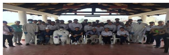
Figure 9 Students participating in the SPCDHOSPP.