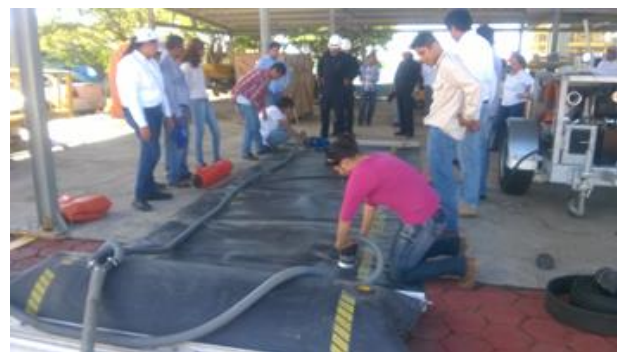
Figure 3 Training with the containment barrier.

Workshops were conducted in contingencies oil spill given by personnel PROMAM and SEMAR where students are trained to identify, prepare and manage the equipment used for the containment and recovery of hydrocarbons (Figure 3, 4 and 5).