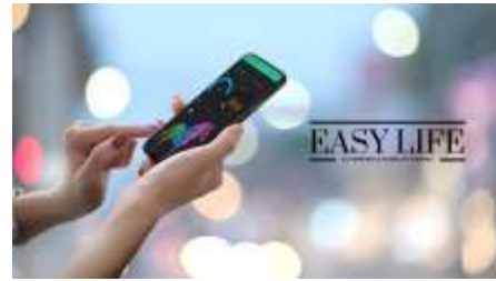
Figure 2 App designed in Blynk software