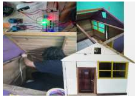
Figure 3 Assembly and final project