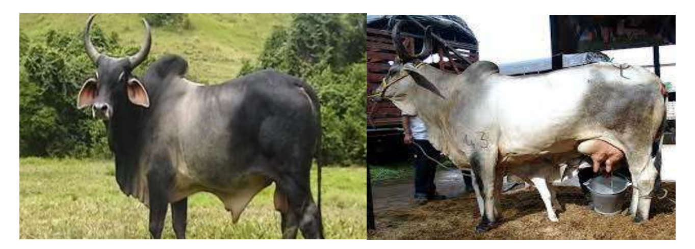
Figure 7.4 Guzerat light gray