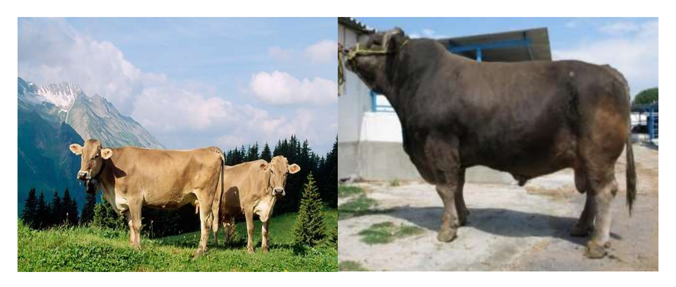
Figure 7.10 Swiss European light Brown