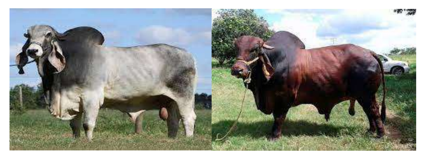
Figure 7.8 Indubrasil red