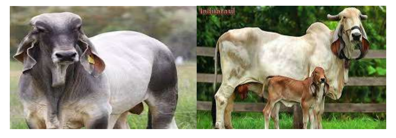
Figure 7.6 Ears on female and calf Indubrasil