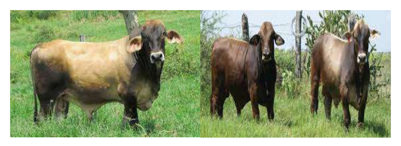
Figura 7. 13 Suiz-Bú dark Brown