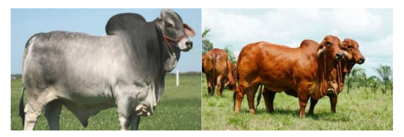
Figure 7.2 Red Brahman