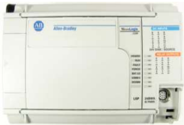
Figure 5 PLC Micrologix 1500 Allen Bradley

An Allen Bradley brand Micrologix 1500 PLC (Figure 5), has been considered as manager for the automation of the greenhouse; it is a device with 12 digital inputs and 12 digital outputs. The inputs can be configured to sink or source, depending on the type of sensor or element used, while the outputs are to relay, which does not condition the use of any particular magnitude or type of electrical supply; which will depend on each device to connect. Communication with the PLC, for its programming, management or data exchange, is possible through the use of two serial ports, mindin and DB9, arranged. While the use of expandable modules extends the functionality of the PLC, by adding a greater number of analog or digital inputs and outputs, as needed.