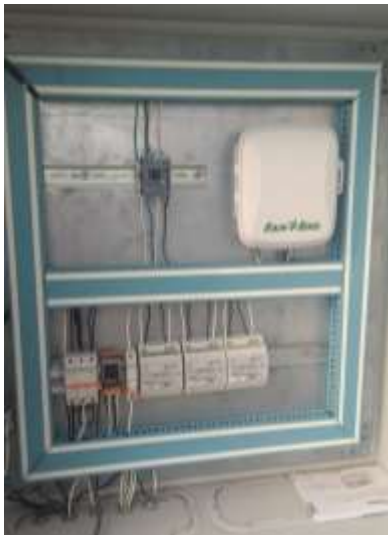
Figure 4 Control panel interior

For activation and management of the aforementioned devices, the electrical panel of Figure 4 was adapted, in which the necessary connections converge to achieve such functions. However, since the operation of each actuator was originally carried out separately, a different actuation, usually manual, was available to enable each one; which highlighted the lack of coordination between the multiple elements, for the joint management of the environmental conditions inside the greenhouse. Only for the irrigation system was there a timer that can govern its operation based on schedules and time periods established by the user.