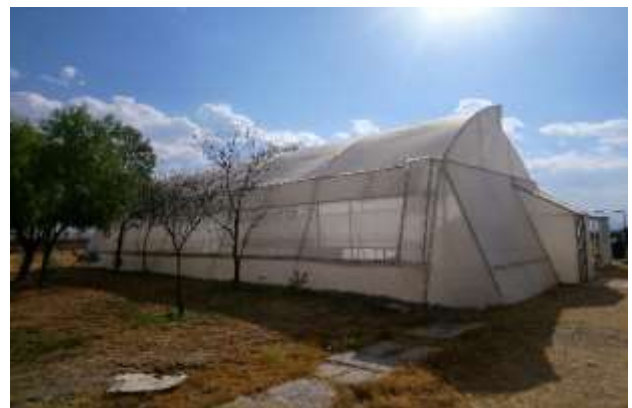
Figure 1 Zenith greenhouse of the Polytechnic University of Aguascalientes

The Polytechnic University of Aguascalientes has two greenhouses located east of Building 4; of these, the exposed intervention was applied in the greenhouse with the largest dimension, which is of the zenith type (figure 1). It is worth mentioning that the physical installation of this greenhouse had to be rehabilitated in its entirety, since it was in disuse. And, since the conditions of the deterioration suffered during a considerable period without functionality were highly evident, it was necessary to cover the structure with plastic, as well as the placement of actuators to perform the functions of heating, air recirculation and operation of the Windows.