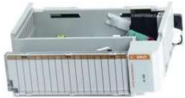
Figure 6 1769-IF4XOF2 Analog Input Module

Each module is equipped with four inputs with a reading range, in voltage from 0 to 10 V and in current from 0 to 20 mA, and two analog outputs from 0 to 10 V; at 16-bit signed resolution in both cases. It is worth mentioning that no analog output was used in this application.