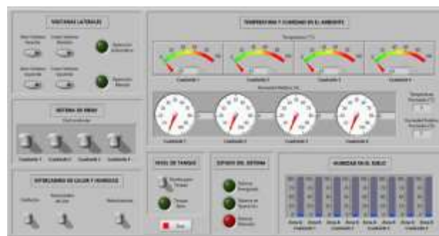
Figure 9 LabVIEW interface for managing environmental variables and devices inside the greenhouse

In this case, the own LabVIEW OPC Server was used for the direct exchange of information with the PLC, performing both the reading of the data provided by each sensor inside the greenhouse, as well as the writing of those that are intended for each actuator used. . Thus, the virtual instrument developed in LabVIEW for managing the functionality of the greenhouse was divided according to the signals acquired or emitted, as the case may be, into: side windows, irrigation system, heat and humidity exchange, tank level, system status, ambient temperature and humidity, and soil moisture, as shown in Figure 9.