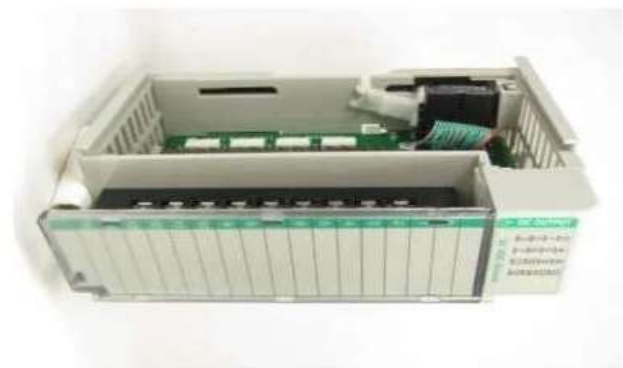
Figure 7 1769-OW16 Digital Output Module

With regard to the action units to be managed, which are exclusively digital, a total of 15 outputs are counted to be used; between devices for the preservation of the temperature and humidity conditions inside the greenhouse, as well as for the indication of the state of the process. However, considering that the proposed PLC only has 12 available spaces, it was necessary to consider the use of a 1769-OW16 expansion module, also from the Allen Bradley brand, for the connection of the remaining elements. This module, shown in Figure 7, has 16 relay outputs; for which, as with the PLC outputs, the connection of loads in alternating current or direct current will be indistinct.