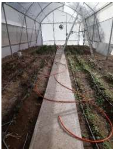
Figure 2 Interior of the zenith greenhouse

The proposed organization of the surface for cultivation in four quadrants and, of these, in two areas (Figure 3), favored the distribution of the devices used to cover the entire installation; in addition, it will contribute to the establishment of a certain space for the sowing of a particular species, once in operation. Likewise, the electrical wiring was adapted, in proximity to the side walls of the greenhouse, to provide an electrical supply to the field devices that require it, or to guide the information coming from them to a concentrator. There was also a tank for storage and supply of water to the irrigation system, as well as a pressurizer, for dispersing and applying it, in the form of steam, to the crops, to complete the rehabilitated agricultural facility.