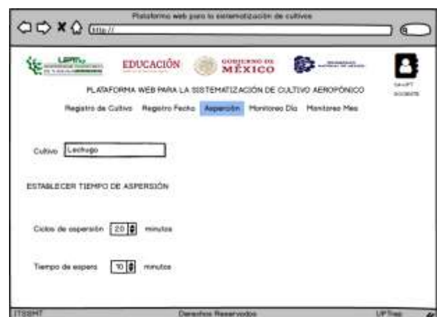
Figure 1 Sprinkling process

Iteration 2 - Platform design: developed in Balsamiq Mockups. In figure 1, the sprinkling process is presented, in which the crop is placed, the sprinkling cycle and the waiting time are established. Figure 2 shows the monitoring design of some of the variables per day.