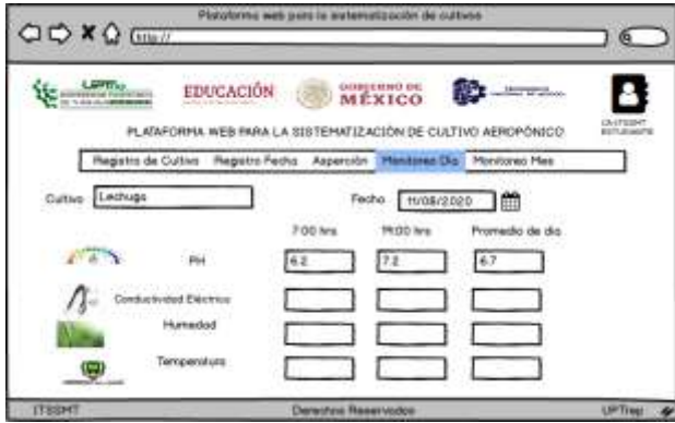
Figure 2 Variable monitoring