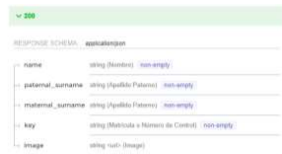
Figure 4 User information

This article only shows some of the parts of the process that were automated on the platform. One of the advantages of the platform is the fact that the relevant variables of the crop are monitored during the production time, as requested. Generating graphs that allow observing how the behavior of these variables varies in the crop and activating the sprinkling times.