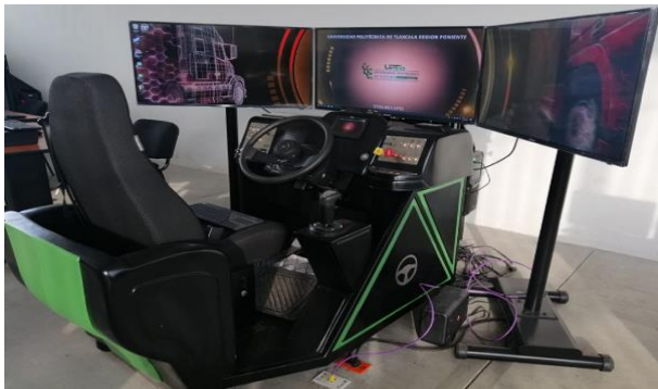
Figure 1 Driving Simulator Big Rig 2 HD

To carry out this research, it was assumed to use the Big-Rig 2.0 simulator as shown in Figure 1, which complements the theoretical aspects of the training with the firm purpose of identifying and reaffirming the principles of highway driving.