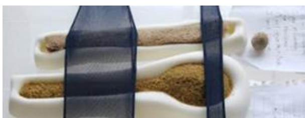
Figure 5 Use of elastic netting

The tests presented below are those that were tied to the mould with elastic mesh to prevent deformation during drying, and were carried out as follows: