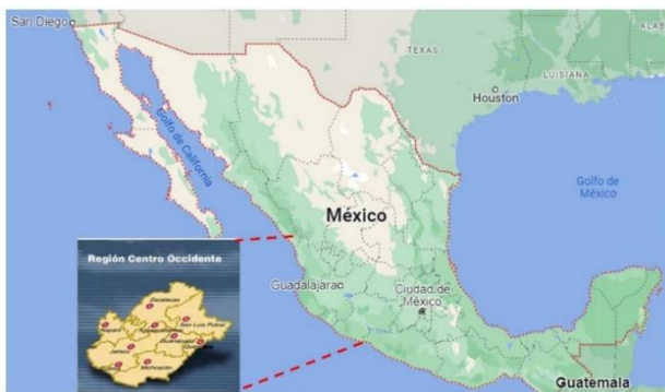
Figure 1 RCO of Mexico

West Central Region (RCO) corresponds to the designation given to 9 states of the Mexican Republic that are located towards the mid-western part of the country, namely: Nayarit, Aguascalientes, Colima, Guanajuato, Jalisco, Michoacán, Querétaro, San Luis Potosí and Zacatecas.