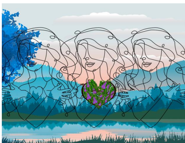
Figure 3 Image designed to represent the production of essential oils by the consortium of producers of aromatic plants in the community of Gudiños Querétaro. Author Eréndira Márquez Castillo

The interlaced lines describe the silhouette of three women with their hands on their hearts giving an embrace effect between them, this element aims to represent the community of the producer and brings with it the feeling of integration and sororidad, the latter concept due to the perceived history that portrays the difficulties they have experienced in such a way that they individual women producers and the union before their entrepreneurship. The heart of the center has lavender, rosemary and thyme leaves and flowers. Finally, the image in the background represents the relationship between nature and the product itself and its production methods.